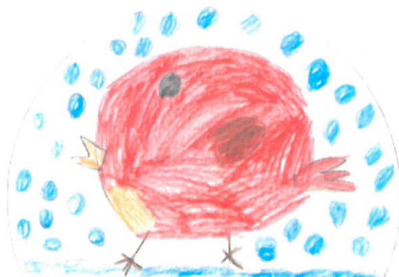
Pudding label drawing template

I look forward to seeing her design on all the delicious Chr... Puddings.