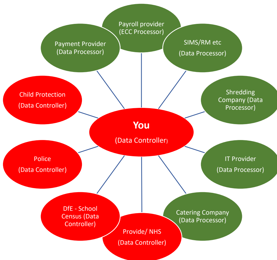
Diagram showing the types of Data Processor a school may work with (Green), and the types of sharing that may occur with other Data Controllers (Red).